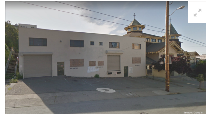
540 De Haro before it was demolished more than two years ago to make way for the new 16-unit condo development.

The Potrero Hill development – which replaced a shabby two-story warehouse building – is now offering condos between $1.1 million and $3.4 million. In all, the condos are worth about $30 million.