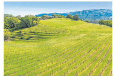
Vineyard View Ranch Near Town

Sound Off: promo tag with dummy text in 4 lines. K2