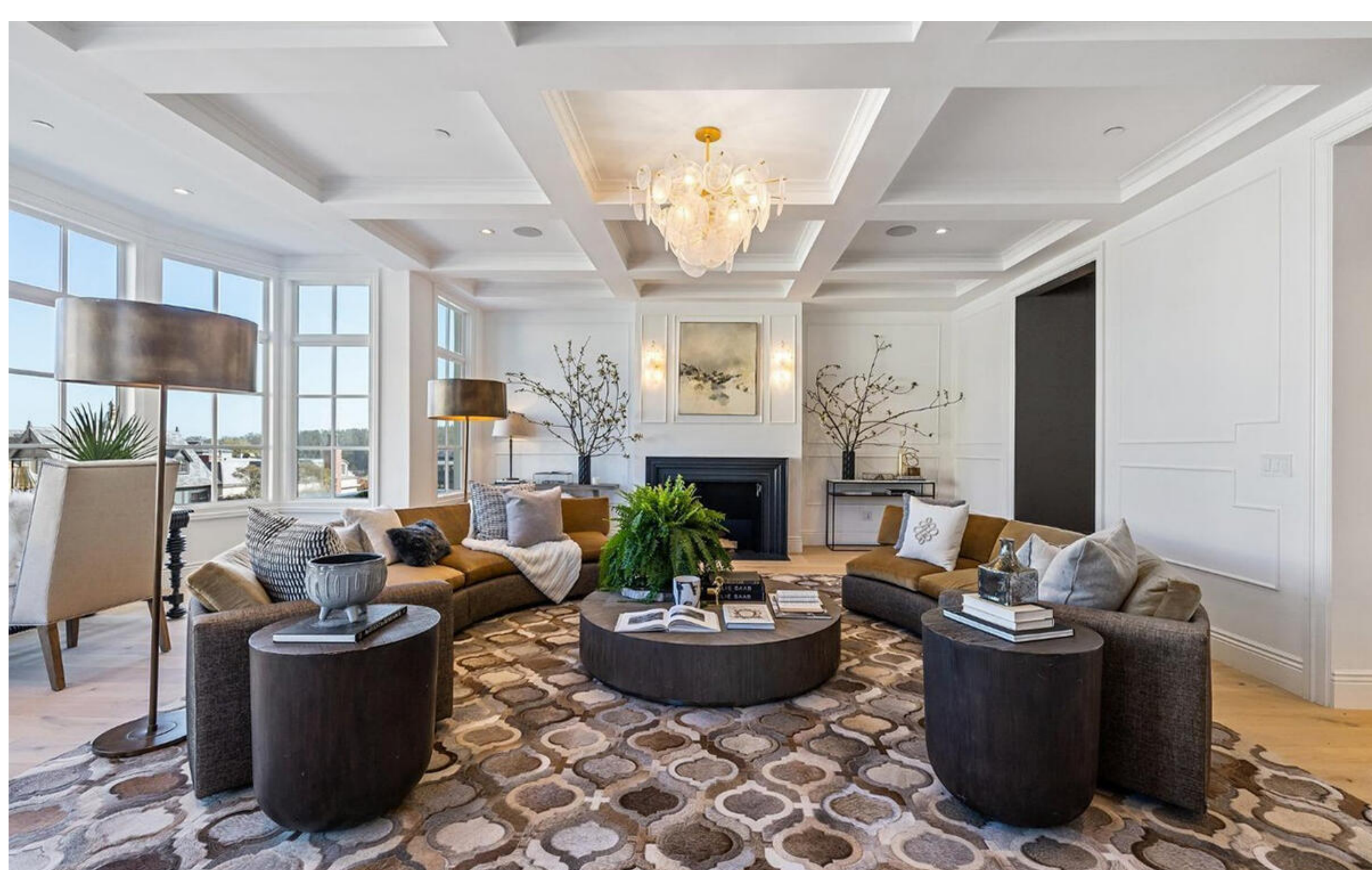
Inside the property