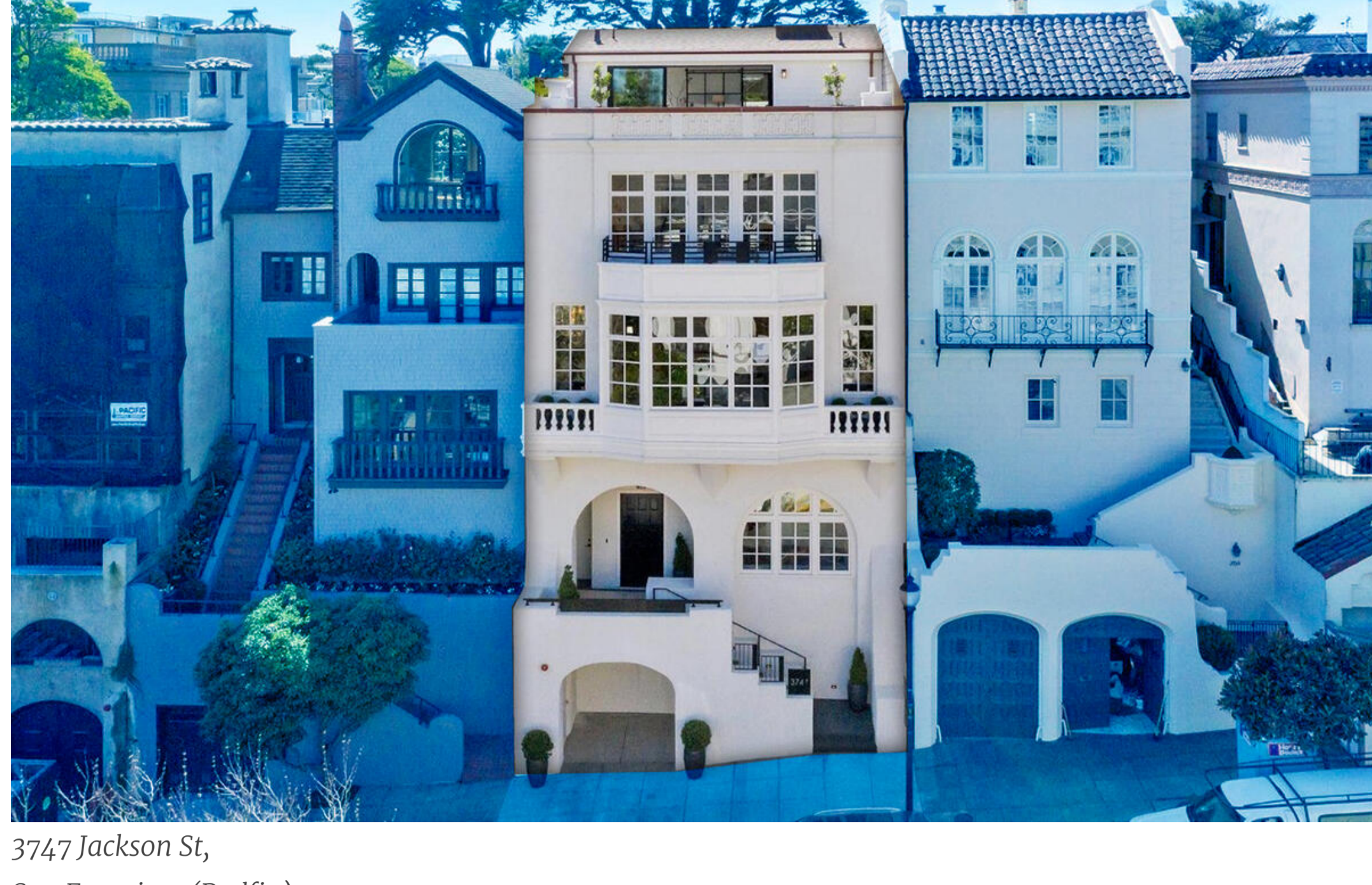
3747 Jackson St, San Francisco