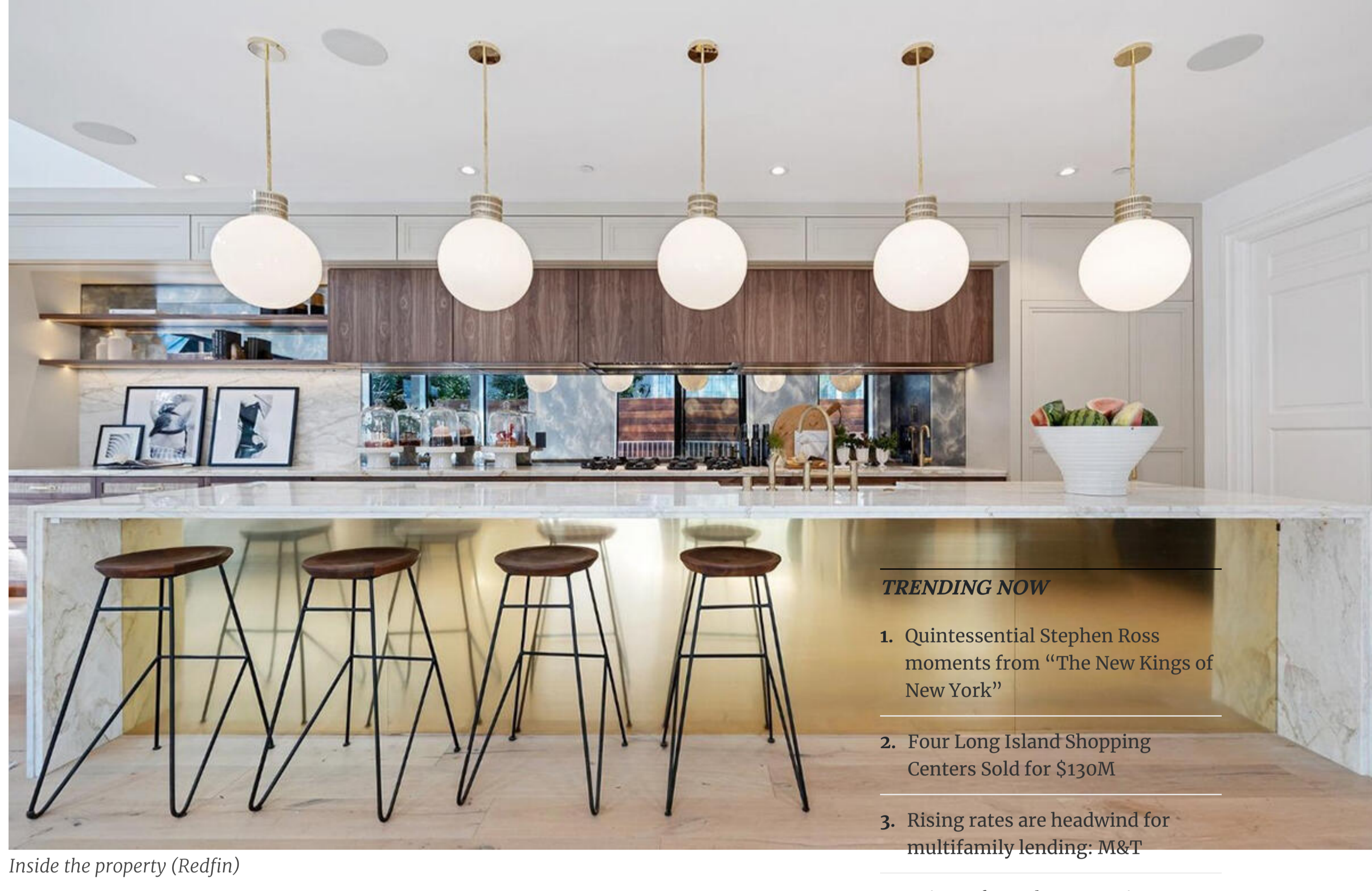
Inside the property (Redfin)

Even if it sold at the lower asking price, the completely remodeled six-bedroom, seven-bath would still be the biggest single-family home deal in San Francisco thus far this year. A Pacific Heights home that came to market last fall at $17 million set the benchmark so far when it sold last month for just under $14 million.